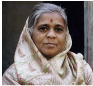
Mahratta of India 29.1 million, Hindu, Unreached ●

The New Testament has been translated into the mother tongue of over 87% of the world's population. However the remaining approximately 13% will require over 1,800 new translations. Bible translation agencies hope to have started all needed translations by 2025.