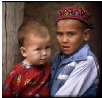
Turkmen of Turkmenistan 4.3 million, Muslim, Unreached ●

Nearly two-thirds of the world is functionally illiterate. Literacy training is an urgent need. The media, orality and story-telling are strategic evangelistic tools.