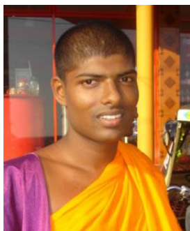
Sinhalese of Sri Lanka 11.3 million, Buddhist, Unreached ●

Active persecution of Christians takes place in many countries such as: Saudi Arabia, northern Nigeria, Somalia, Algeria, Libya, North Sudan, Yemen, Egypt, Syria, Iraq, Iran, North Korea, Vietnam, Laos, China. Over 250,000 believers may be martyred this year.