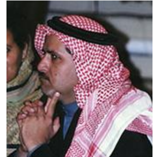
Najdi of Saudi Arabia 11.9 million, Muslim, Unreached ●

81% of the world's Buddhists, Hindus and Muslims do not know a Christ-follower.