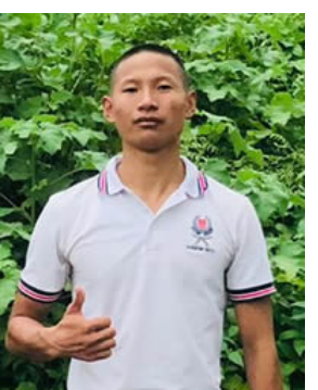
World Popl: 8.600 Total Countries: 1

People Cluster: South Asia - other Main Language: Nachiring Main Religion: Other / Small