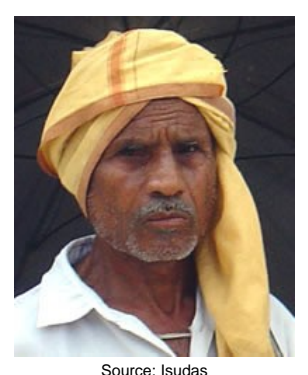
Population: 140,000 World Popl: 144,300