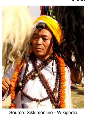
Population: 32,000 World Popl: 32,000 Total Countries: 1

People Cluster: South Asia - other Main Language: Kulung (Nepal) Main Religion: Other / Small Status: • Unreached Evangelicals: Unknown % Chr Adherents: 0.29%