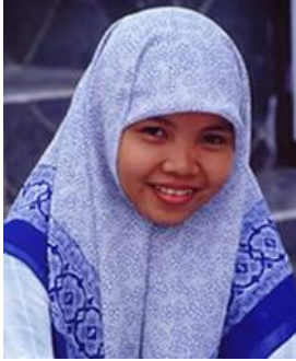
Madura of Indonesia 7.3 million, Sunni Muslim, Unreached ●

Of the estimated 16,900 ethnic people groups in the world, about 7,000 still have less than 2% followers of Christ meaning 41% of all people groups are considered least-reached.