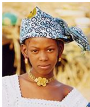
Fula Jalon of Guinea 5.5 million, Sunni Muslim, Unreached ●

About 90% of all Christian outreach / evangelism targets nominal Christians in already reached areas. Conversely, only about 1 in 10 missionaries serves among unreached people groups.