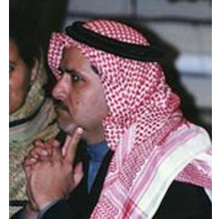
Najdi of Saudi Arabia 13.1 million, Muslim, Unreached ●

81% of the world's Buddhists, Hindus and Muslims do not personally know a Christ-follower.