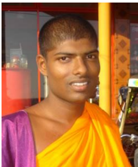
Wahumpura of Sri Lanka 8.1 million, Buddhist, Unreached ●

Active persecution of Christians takes place in many countries such as: Saudi Arabia, northern Nigeria, Somalia, Algeria, Libya, North Sudan, Yemen, Egypt, Syria, Iraq, Iran, North Korea, Vietnam, Laos, China. Over 250,000 believers may be martyred this year.