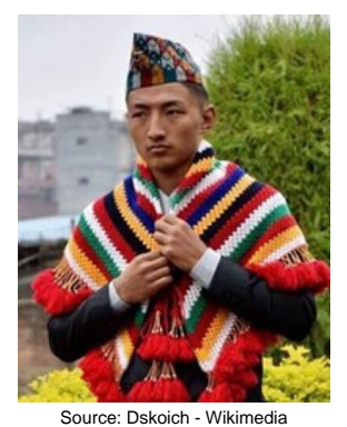
Population: 65,000 World Popl: 166,000