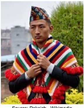
Population: 65,000 World Popl: 166,000