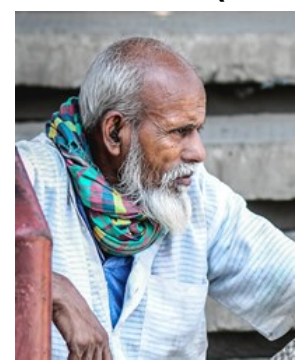
Population: 108,000 World Popl: 1,112,000