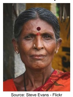
Population: 76,000 World Popl: 8,443,400