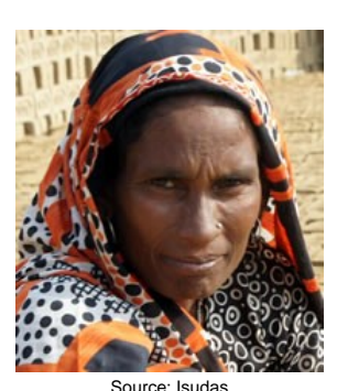
Population: 70,000 World Popl: 1,167,000